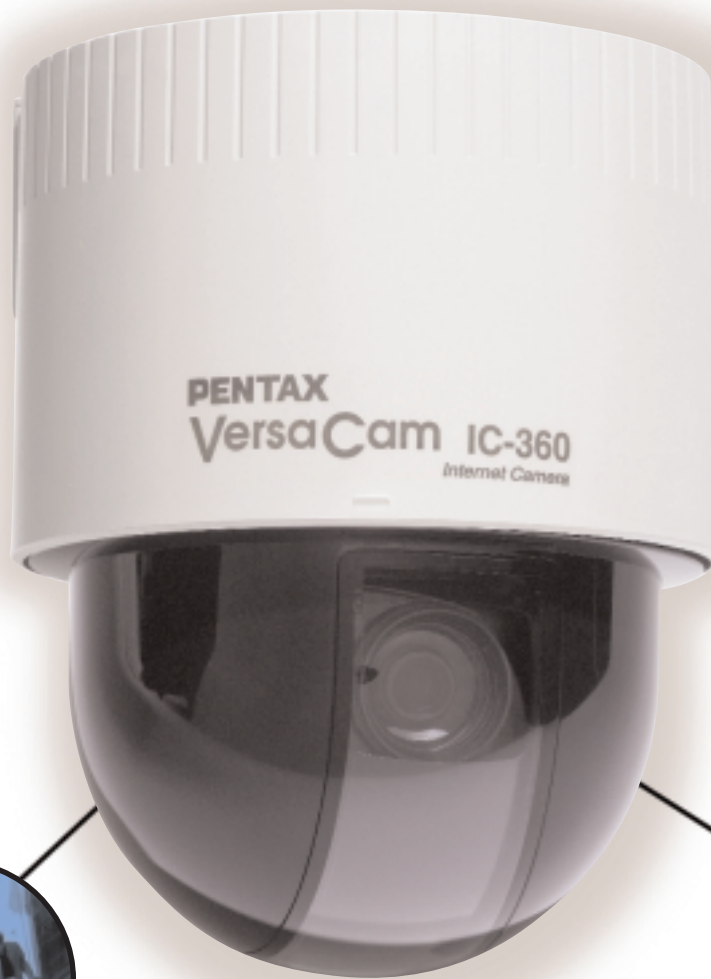
Open the door to security applications.